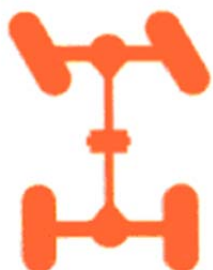
Fron axle steering