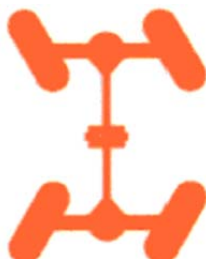
Both axles steering